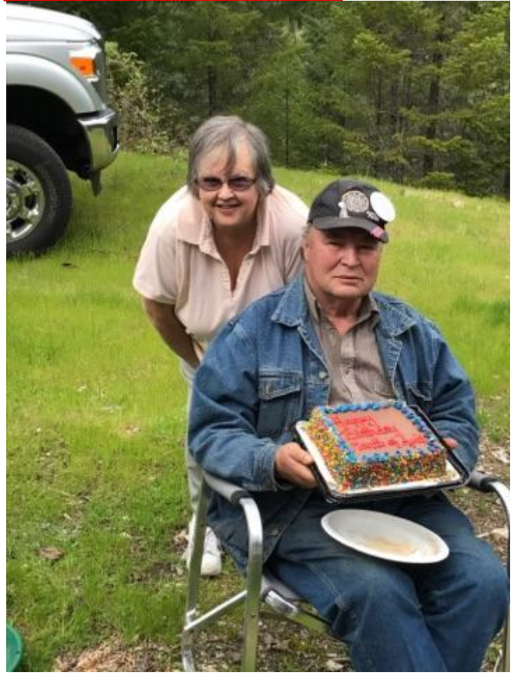
.Happy April Birthday's!!!